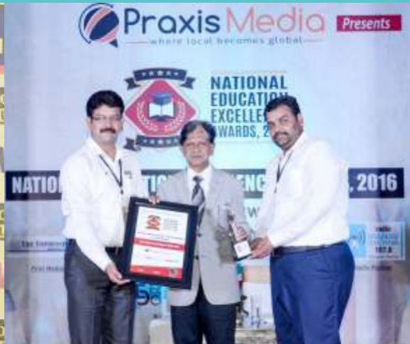
"BEST ENGINEERING COLLEGE IN DELHI-NCR" 2016 AWARDED BY SH. ANIL SHASTRI (FORMER FINANCE MINISTER, GOVT. OF INDIA) S/O LATE SH. LAL SHAHASTRI