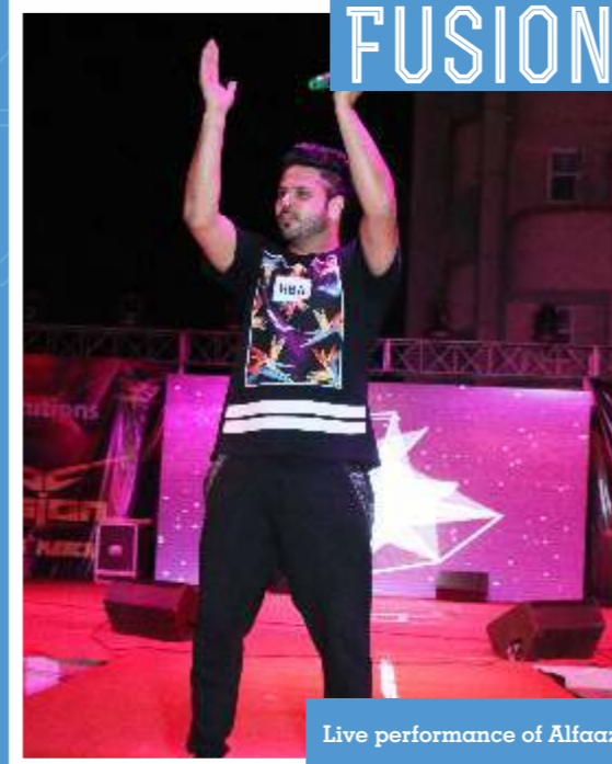
Live performance of Alfaaz