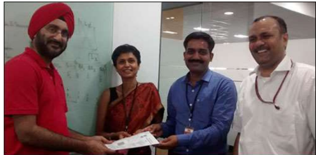
Aditya Birla Group, Enterprise wise roll out of FLIP programs.